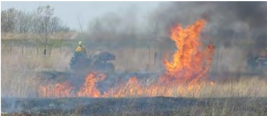
2005 burn at Havenwoods

Reminder: The prescribed burn will be either April 16 or April 23, weather permitting. Conditions are looking very favorable right now for it to be on the 16th - this Saturday - at about 10:30 am. Save the date if you would like to watch our DNR burn crew in action.