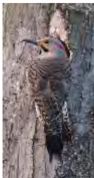
northern flicker: CC3.0, photo by Greg Hume