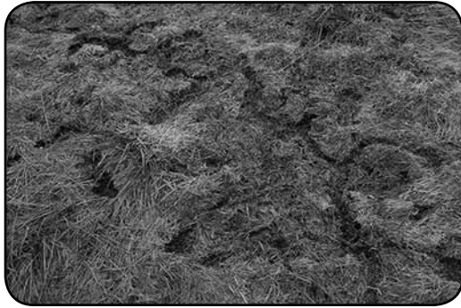
Jim Barton, 2010 / CC BY-SA 2.0

The snow will be melting soon. And, as it melts, it will reveal several months worth of hidden activity.